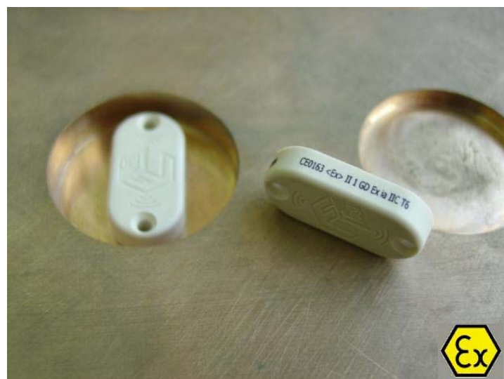
Figure 3. Ferroxtag on screw box ATEX certified re-tuned for metal notch applications.

If higher temperature capabilities were required (up to 180°C), or if an ATEX certified tag was needed, upon request, we can also re-tune our standard on metal screw Ferroxtag to be used in metal notch applications.