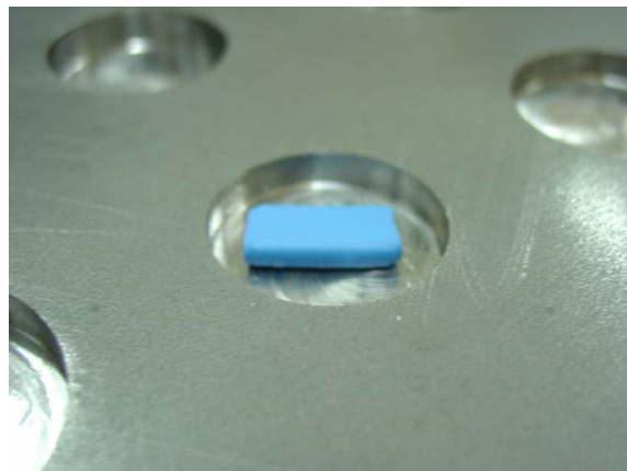
Figure 1. Ferroxtag in metal notch

We have to differentiate the application where you install the tag on the surface of a metal item (we only find metal under the tag) and the application where the tag is partially surrounded by metal (see below picture).